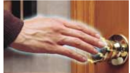
You can avoid those annoying shocks of static electricity this winter by adding a Carrier humidifier to your comfort system.

These features, along with our hard-earned reputation for delivering top-quality products make choosing a Carrier humidifier an easy choice. Once you choose Carrier, your local Comfort Control Specialist will analyze your system and help select the perfect humidifier model for controlling your indoor comfort.