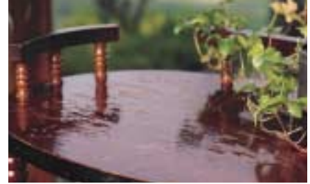
A Carrier humidifier helps protect your furnishings for years by preventing damage due to dryness, cracking and separating.

As warm, dry air passes through the humidifier pad, moisture is absorbed into the air and distributed throughout your home for a more comfortable indoor environment.